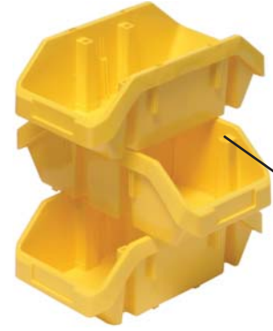
Cross Stack 'em